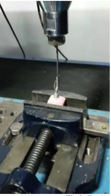
Fig 9: Testing