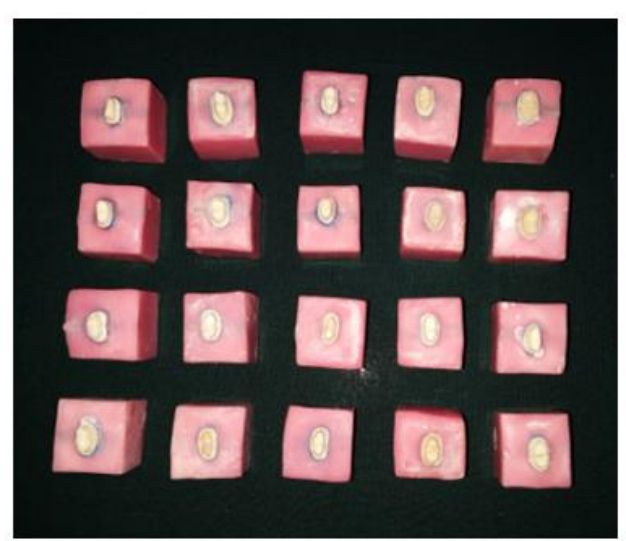
Fig 5: Group C and Group D