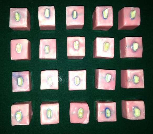
Fig 4: Group A and Group B