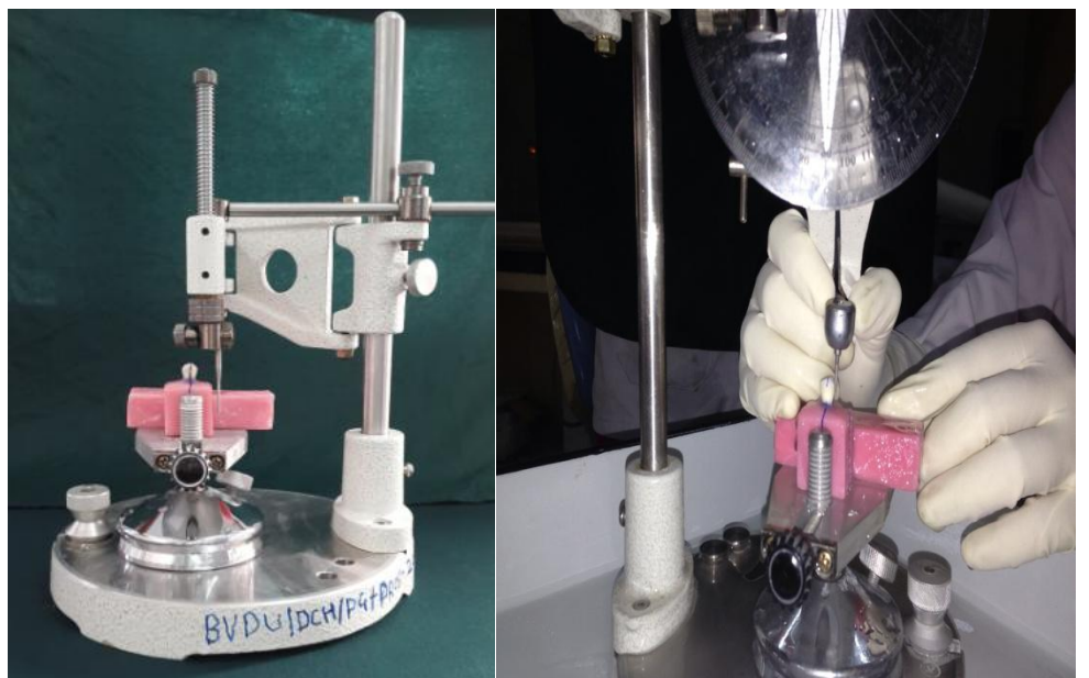
Fig 2: Surveyor used to acheive parallelism.

Effect of different preparation heights and luting agents on tensile bond strengths in Nickel ..