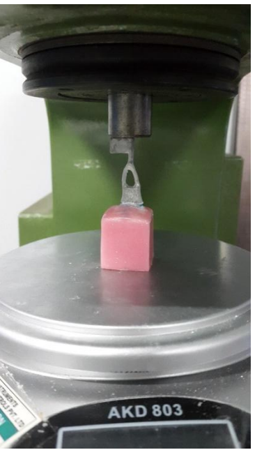
Fig 8: Cementation