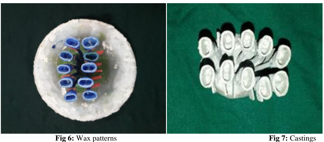
Fig 6: Wax patterns